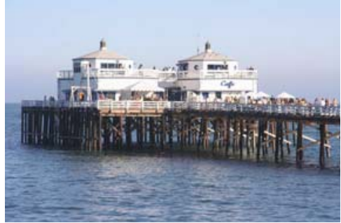
Charles Krug Winery, Natural History Museum and Malibu Pier