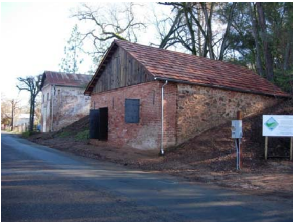
Historic Chinese Structures