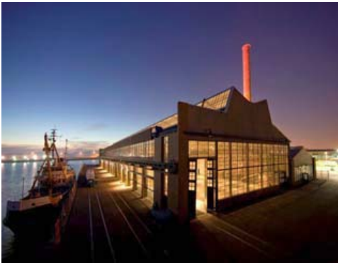
Ford Assembly Building