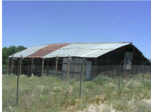
Beringer Vineyards Rhine House and Mortise & Tenon Timber Barn