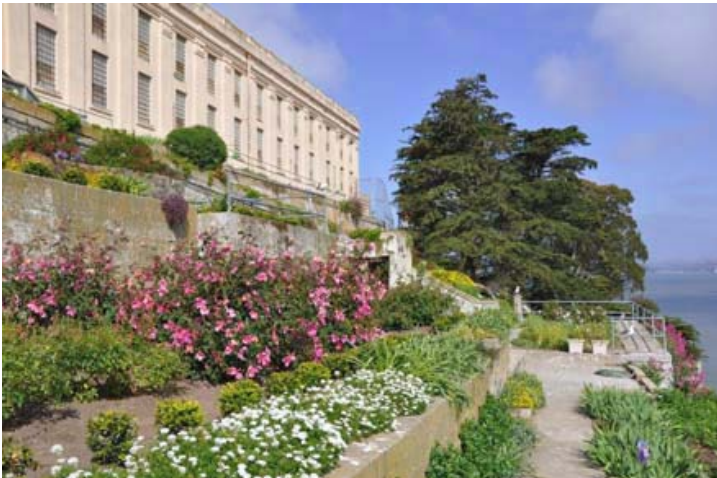
Alcatraz Historic Gardens